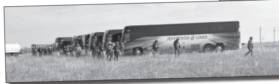
Montana Angus Tour 2023 Indreland Angus Stop